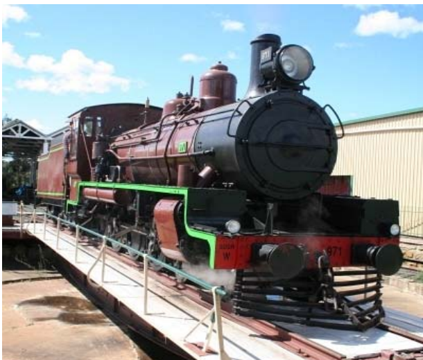
C17 971 stands on the turntable at Warwick on Saturday 8 September during the ATRO AGM meeting hosted by SDSR.