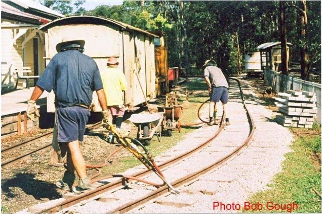
ANGRMS track workers putting the finishing touches to the recently constructed passing loop at Woodford Station