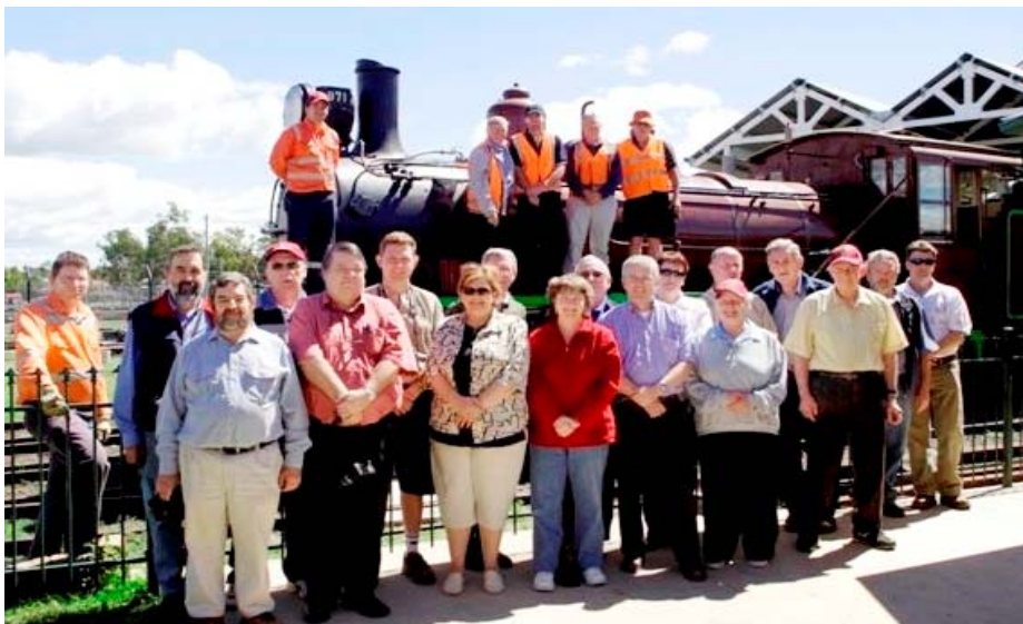
Delegates at the ATRQ meeting in Warwick pose beside C17 No.917